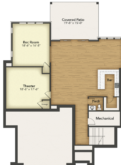
OPTIONAL BASEMENT LEVEL